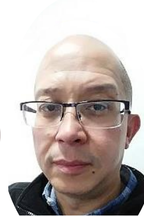
Website Bill Best